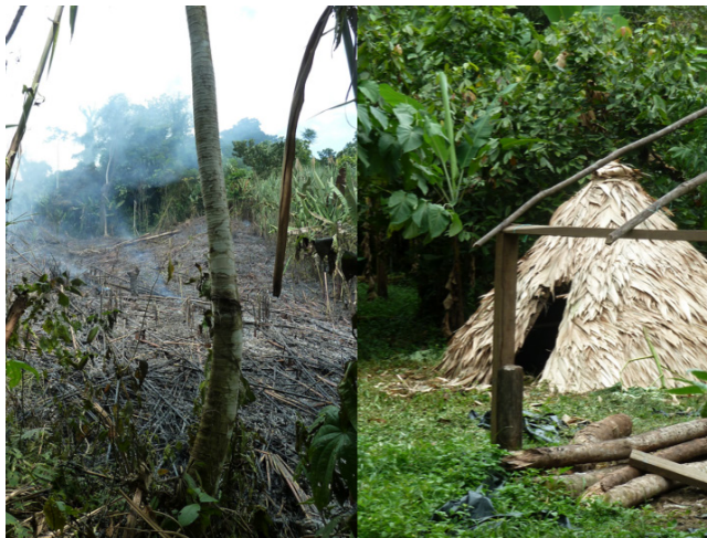
Figure 2: Shifting corn cultivation project (left) to grow corn to feed chicken being raised in the structure on the right called tôl .

Overall, using ulâpeitök as a guide to define our research partnership was central to shifting power to our community colleagues so they could define an approach compatible with their values and address on-the-ground needs of their community. Without the input of women early in the project, Olivia would have never imagined taking on the role of an English teacher, nor would she have understood the need to incorporate community accountability, i.e., extending benefits to as many community members as possible.