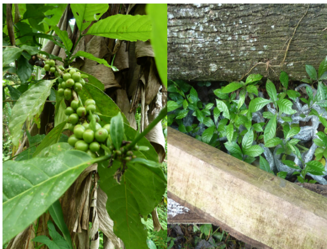
Figure 4: Organic coffee project. Seeds were purchased from Elders in Bajo Coen (left) and seedlings were grown by members of the Sɛbliwak group.